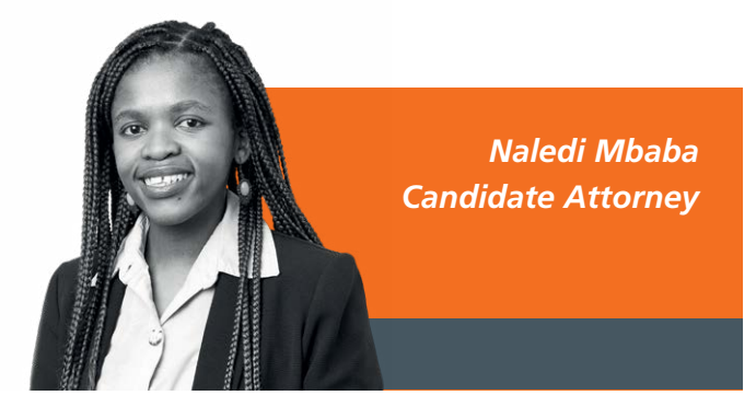
What has been your real lived experience of the firm?

"The people and its diversity have made Webber Wentzel feel like home."